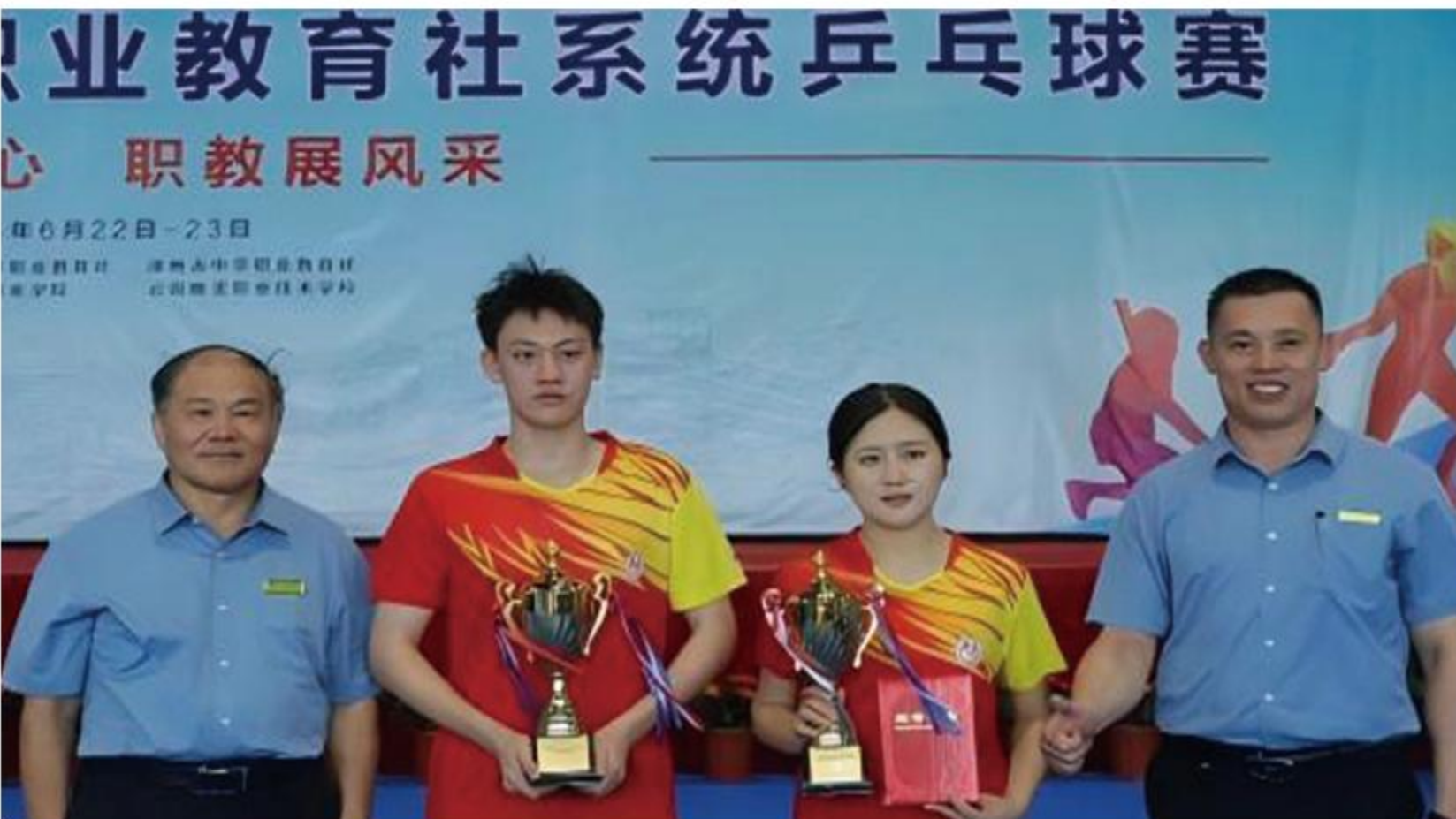
Taiwan Student Awards Prizes in Table Tennis Competition

In addition, ZCST has absorbed dozens of overseas students from Taiwan and Hongkong areas, playing a positively significant role in promoting the cross-strait relations.