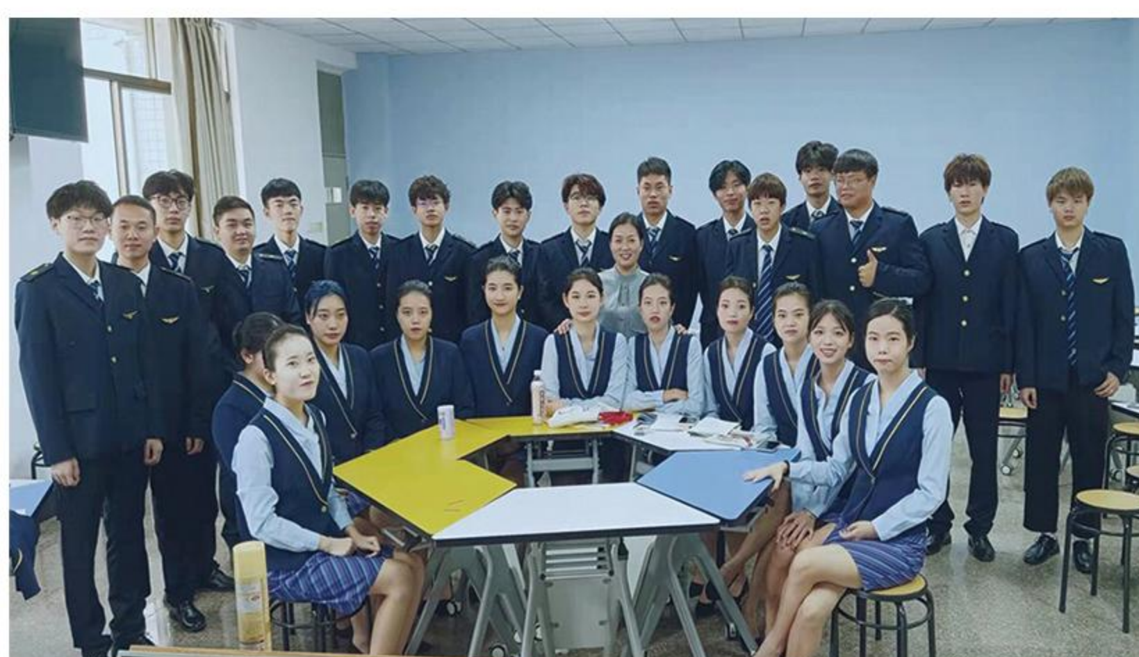
Students of Education and Tourism School