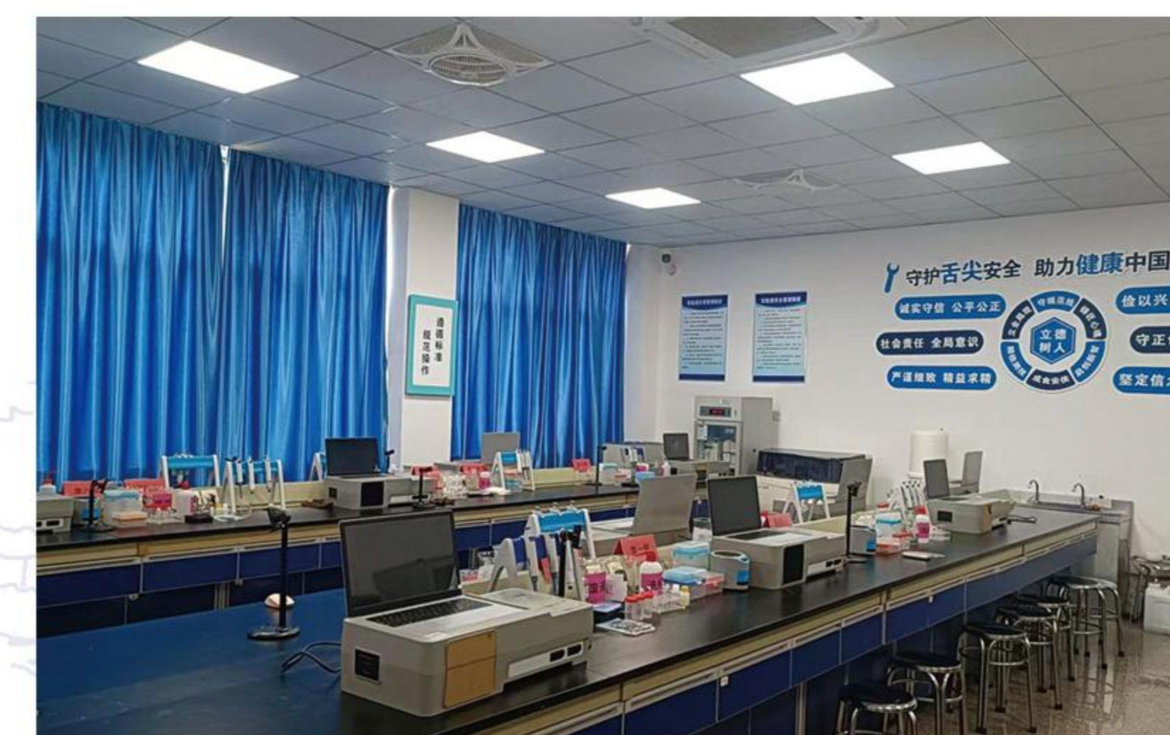
Food Inspection Training Room

The School holds a number of high-quality professional credentials, such as a provincial-level “Double High-Level” professional group and state-level key majors. Equipped with comprehensive practical training platforms and solid hardware capabilities, the school has established various high-quality platforms, including national and provincial-level practical training bases, high-skilled talent training bases, and collaborative innovation centers. Furthermore, as the Certified Tea Artist Examination Center authored by the National Ministry of Human Resources and Social Security, the school serves as a provincial-level training base for the yearly World Skills Competition and a pilot unit for the reform of provincial vocational skill level certification, providing strong support for practical teaching as well as fostering a large quantity of well-known talents in the tea industry.