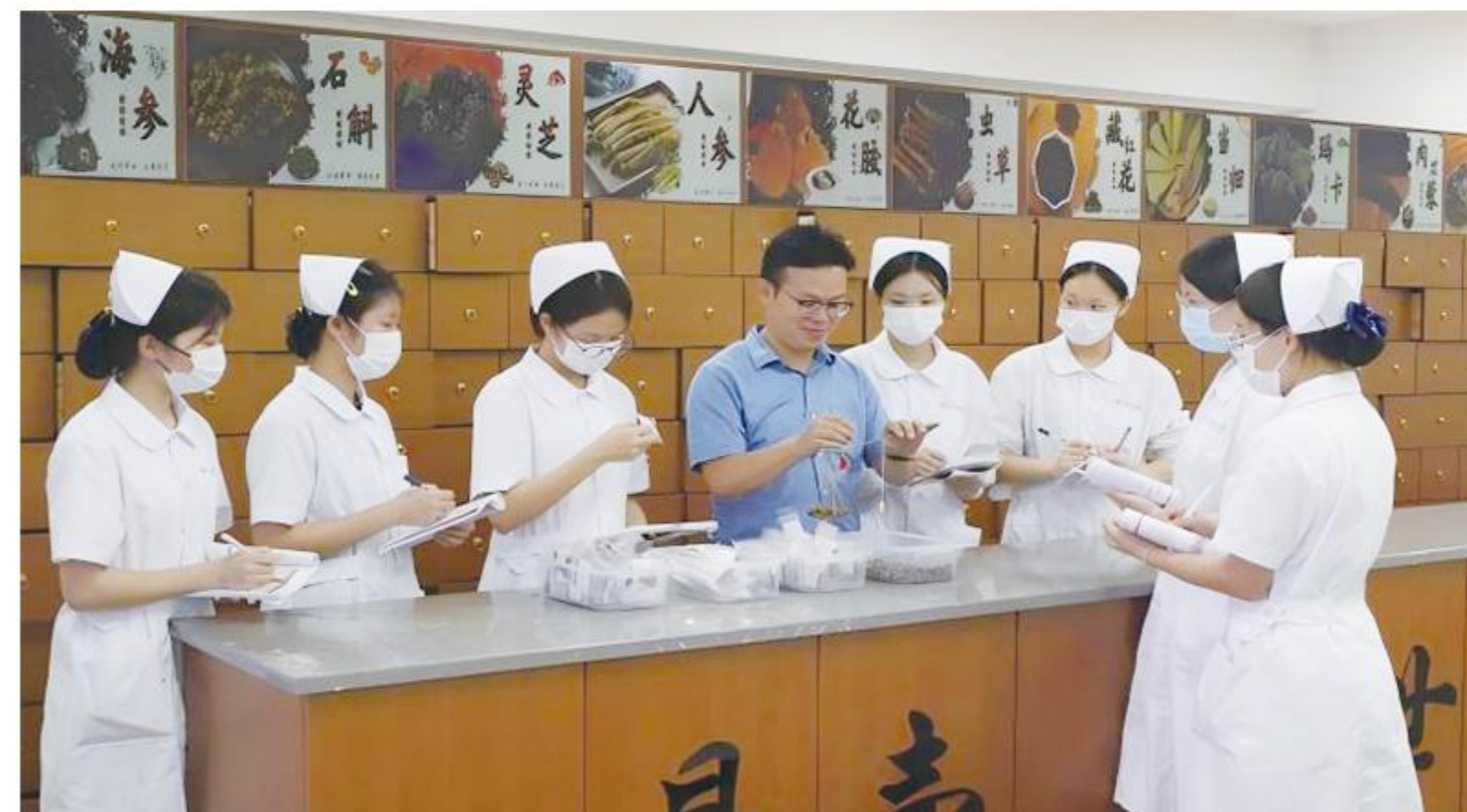
Drug Dispensing Course

With more than 30 training rooms, the school has collaborated with over 20 provincial-level tertiary hospitals and a number of universities with jointly cooperative tasks related to teaching, scientific research, and internship training. With a strong faculty team, the Medical School has guided students to win numerous awards in various competitions. With over 90% of its students' employment in medical institutions/hospitals and remarkable achievements in medical field, the school has been honored with such titles as "National Excellent Social Practice Team" and "National Pilot School for First-Aid Education in Schools".