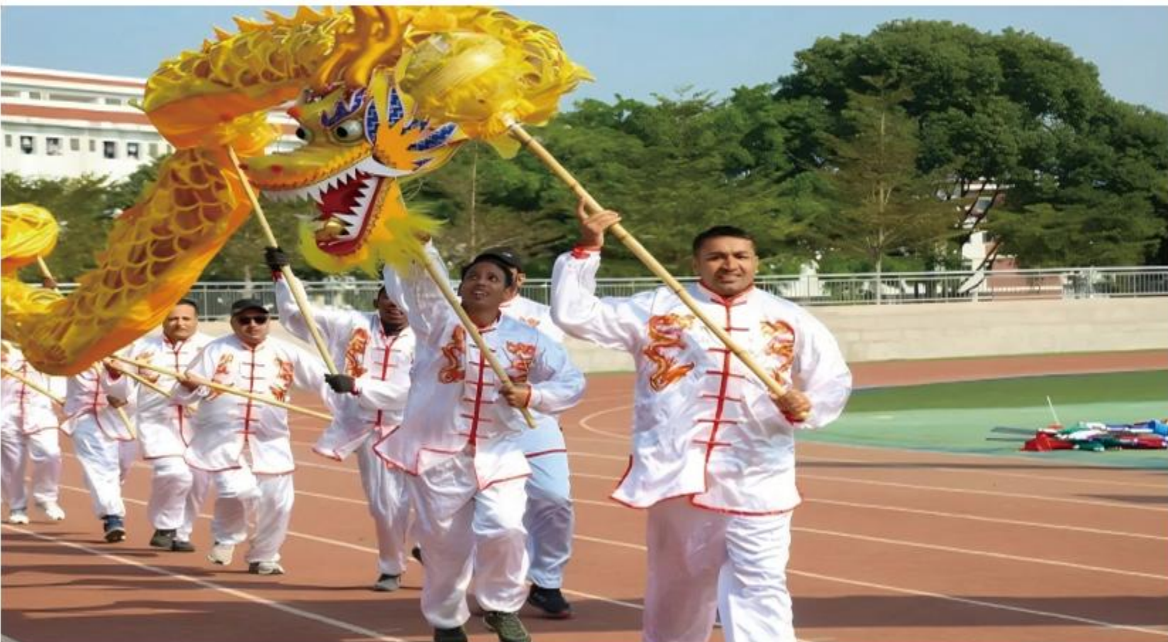
Lion Dance Performance