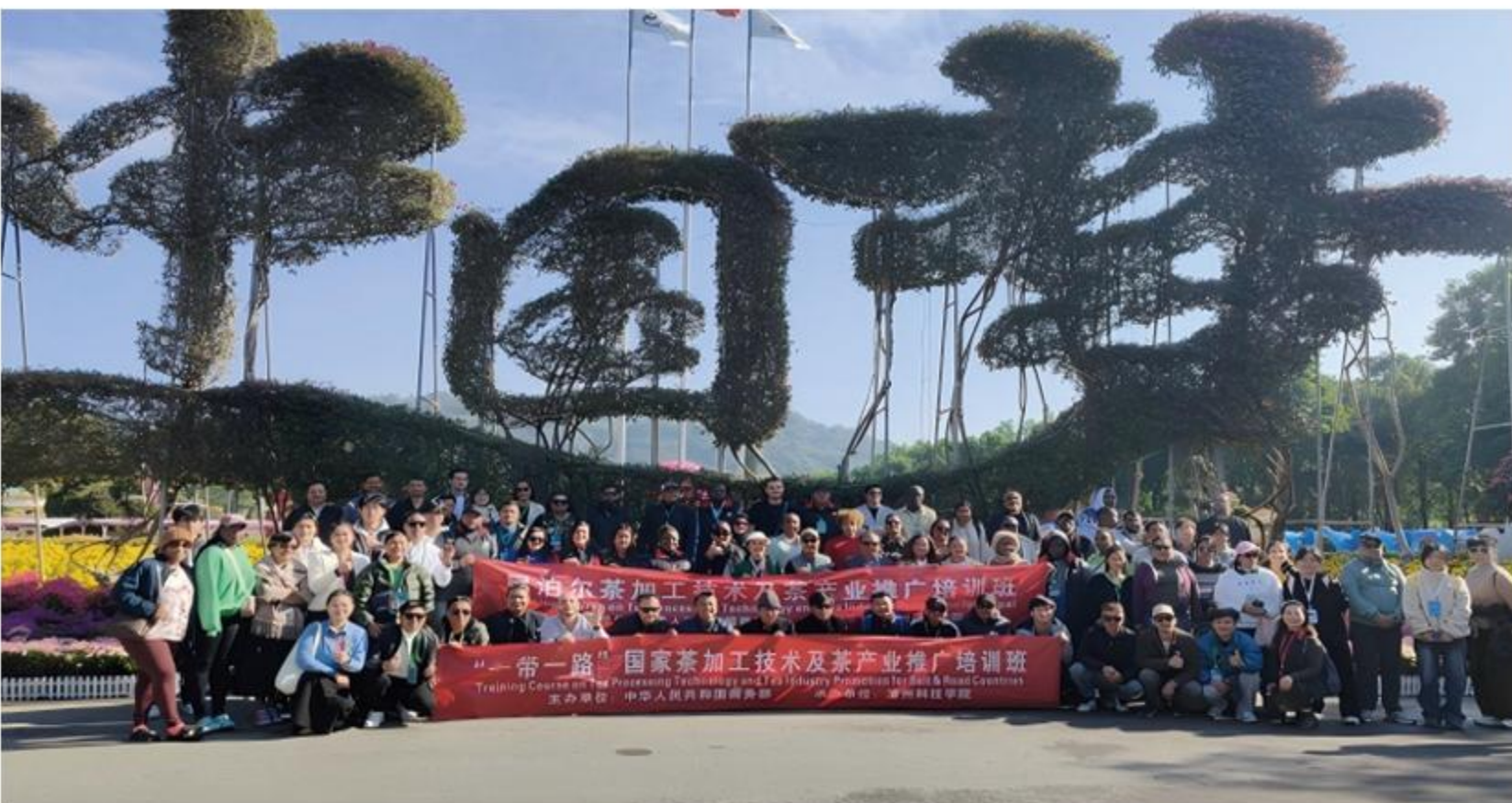
Inspection Tour of Training Program

ZCST is actively moving on the road of international exchange and cooperation, yielding fruitful outcomes in international education. Since 2009, ZCST has hosted dozens of China-Aid Projects commissioned by the National Ministry of Commerce. By the end of 2025, a total of 1,621 participants from 66 countries have attended various themed training courses at ZCST, which cover agriculture, tourism, telecommunication and tea-related specialties. The implementation of these China-Aid Training Program has played a positive role in strengthening the understanding and relationship between China and the participant countries as well as the popularization and exchange in tourism, agricultural technologies and electronic communication. Meanwhile, these programs have fully demonstrated China’ s achievements in economic and social development, and made significant contributions to publicizing the Chinese culture abroad and advancing the Belt and Road Initiative as well.