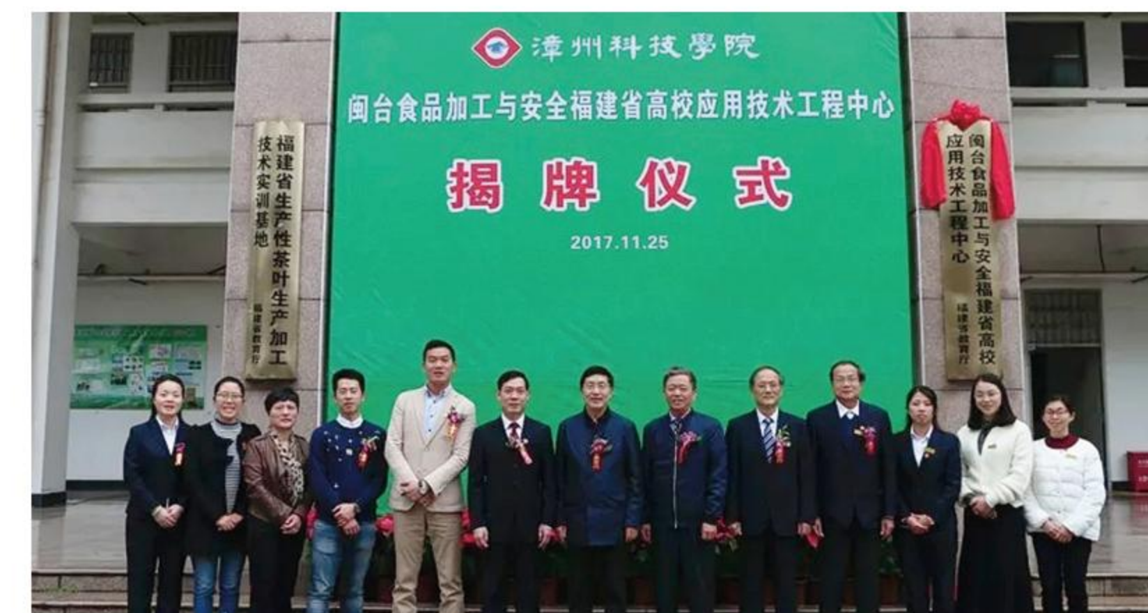
Fujian-Taiwan Food Processing and Safety at University Applied Technology Engineering Research Center in Fujian

In terms of Fujian-Taiwan Cooperation, relying on its geographical advantages and resources from Tenfu Group, ZCST has set up sister-school relationships with 25 universities/colleges in Taiwan area. It focuses on such key majors as food baking, cosmetics and nursing, and deepens cross-strait educational integration by exposing students to unique Taiwan vocational education conceptions through faculty and student exchange, sharing joint training laboratories as well as cooperative academic and professional programs.