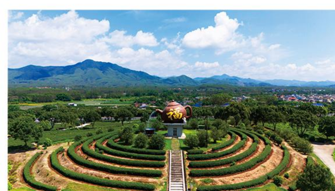
One of the Tea Gardens