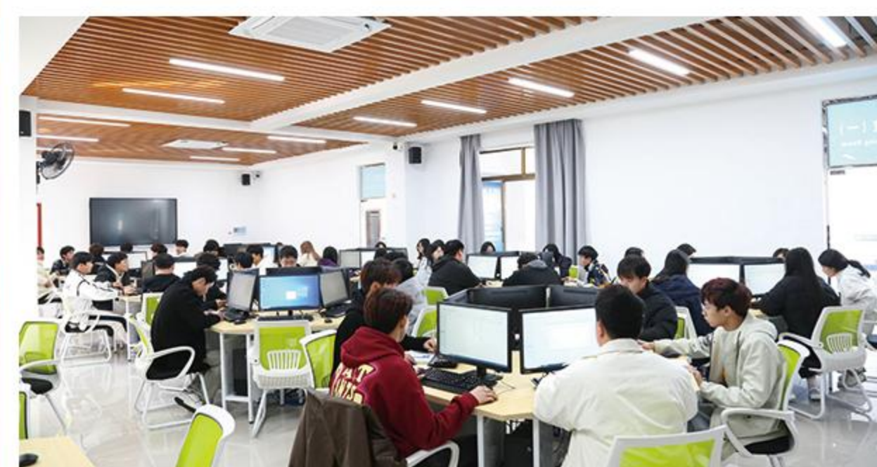
Students of Business School in Class