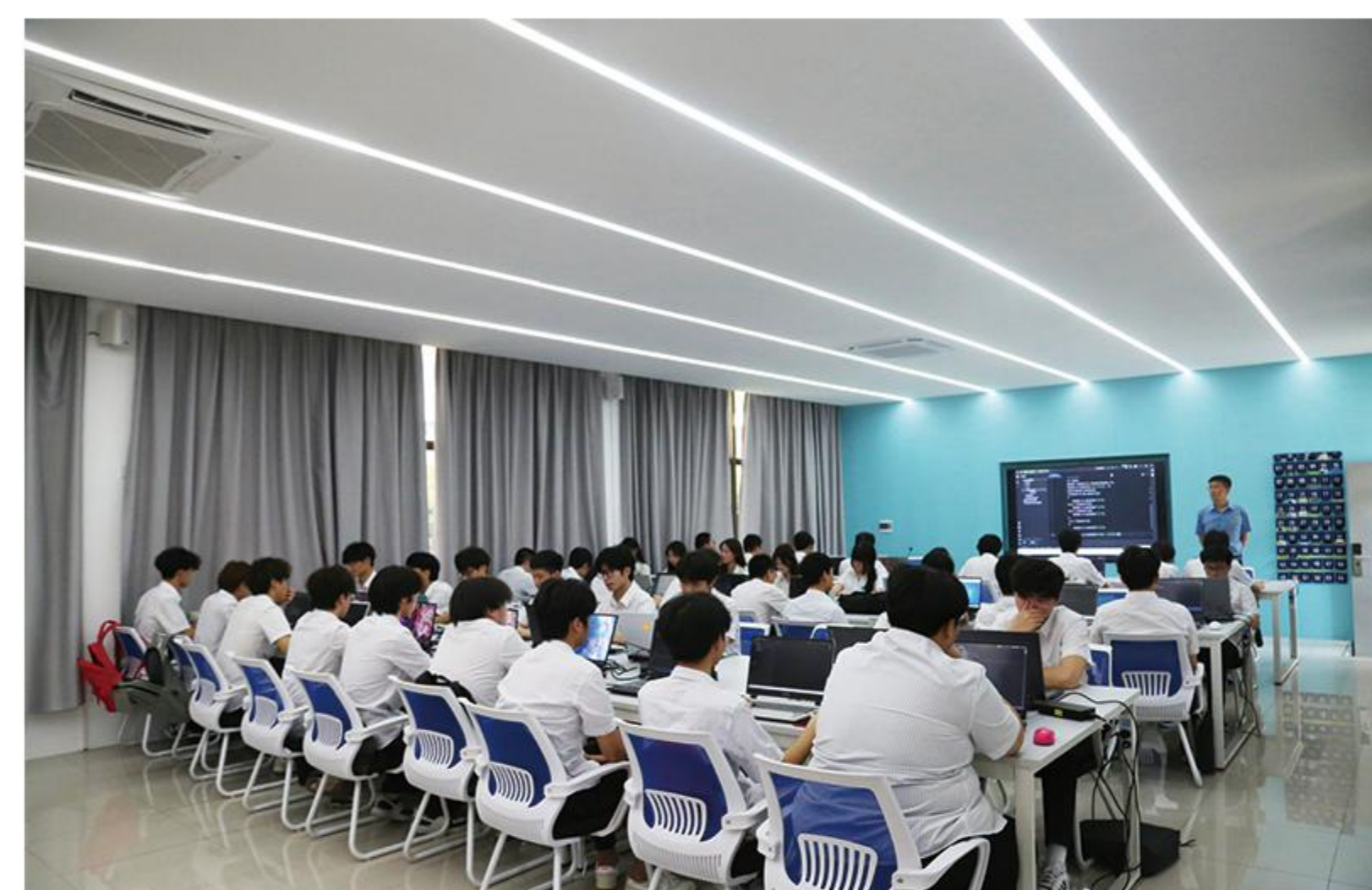
Artificial Intelligence Course