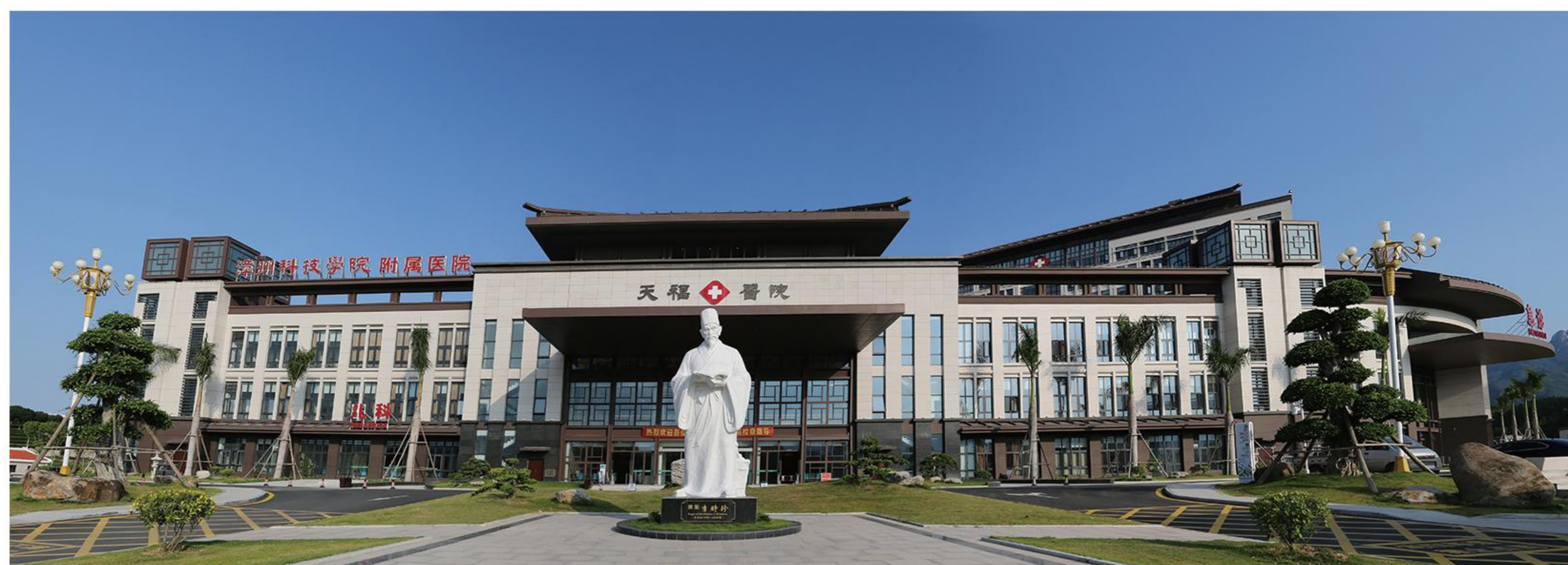
Tenfu Hospital Affiliated to Zhangzhou College of Science and Technology

With more than 30 training rooms, the school has collaborated with over 20 provincial-level tertiary hospitals and a number of universities with jointly cooperative tasks related to teaching, scientific research, and internship training. With a strong faculty team, the Medical School has guided students to win numerous awards in various competitions. With over 90% of its students' employment in medical institutions/hospitals and remarkable achievements in medical field, the school has been honored with such titles as "National Excellent Social Practice Team" and "National Pilot School for First-Aid Education in Schools".