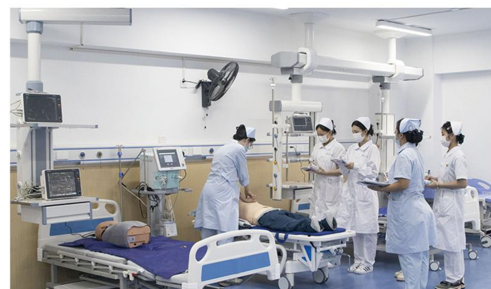
First-Aid Training Course at Medical School

It should be emphasized that the Tea and Food School, as the characteristic part of ZCST, has become a renowned featured tea major among peers across China with remarkable achievements in tea plantation, culture, talent cultivation, and practical tea technique teaching. The School offers five core majors, namely Tea Production&Processing Technology, Tea Art&Tea Culture, Intelligent Food Processing Technology, Food Inspection &Testing Technology and Western Cuisine Technology.