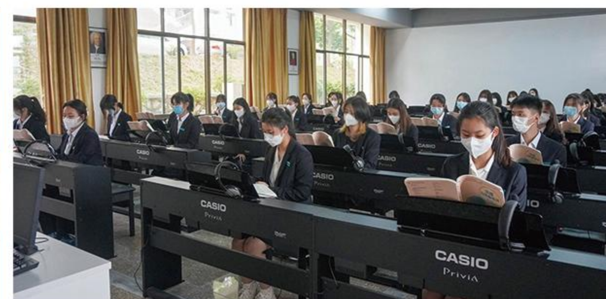
Students of General Education School in Class