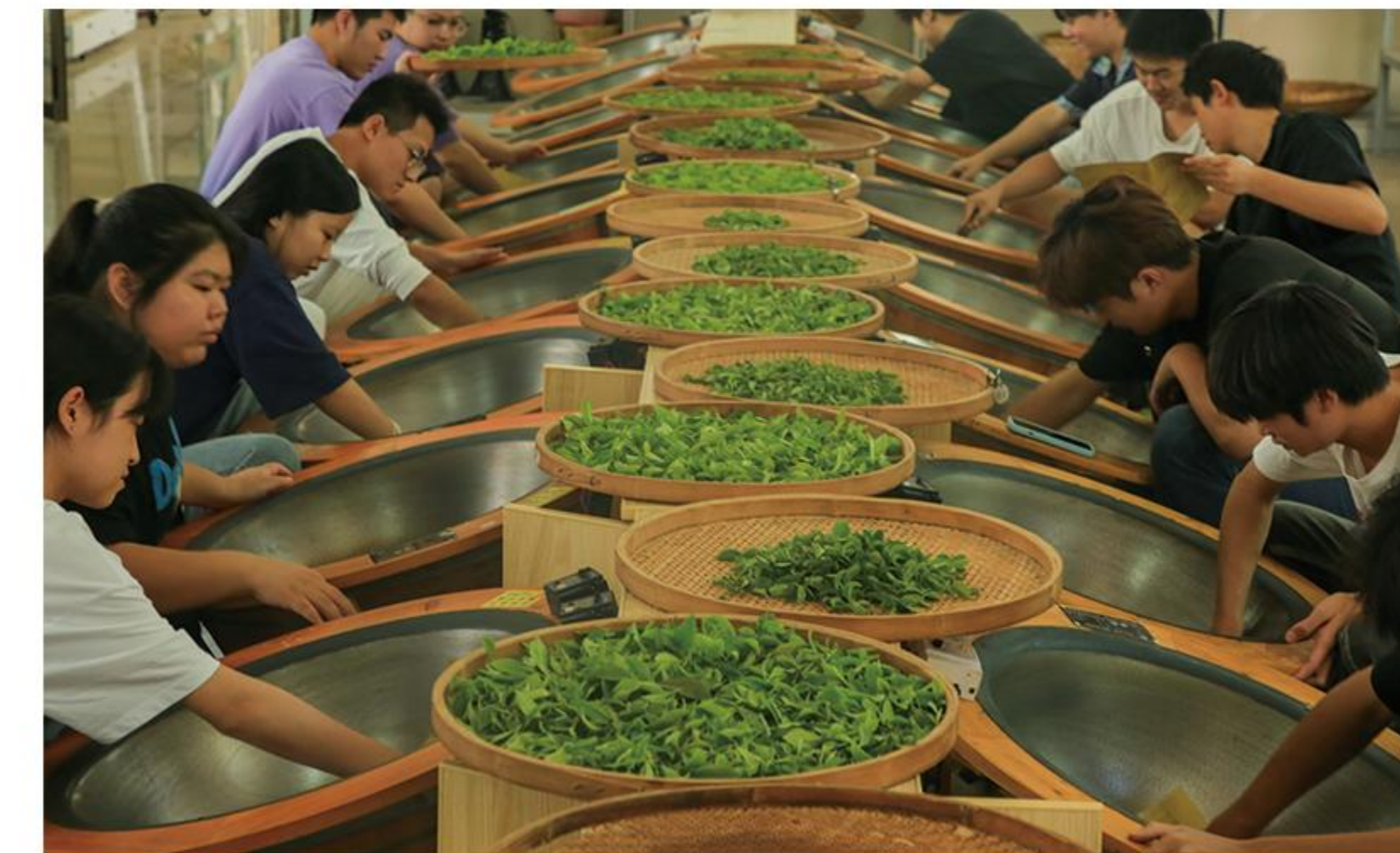
Tea Processing Class

It should be emphasized that the Tea and Food School, as the characteristic part of ZCST, has become a renowned featured tea major among peers across China with remarkable achievements in tea plantation, culture, talent cultivation, and practical tea technique teaching. The School offers five core majors, namely Tea Production&Processing Technology, Tea Art&Tea Culture, Intelligent Food Processing Technology, Food Inspection &Testing Technology and Western Cuisine Technology.