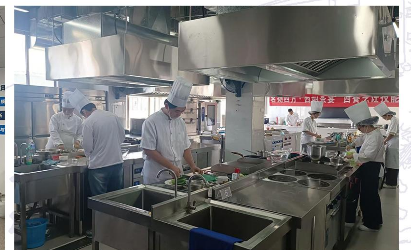
Western Cuisine Cooking Training Room