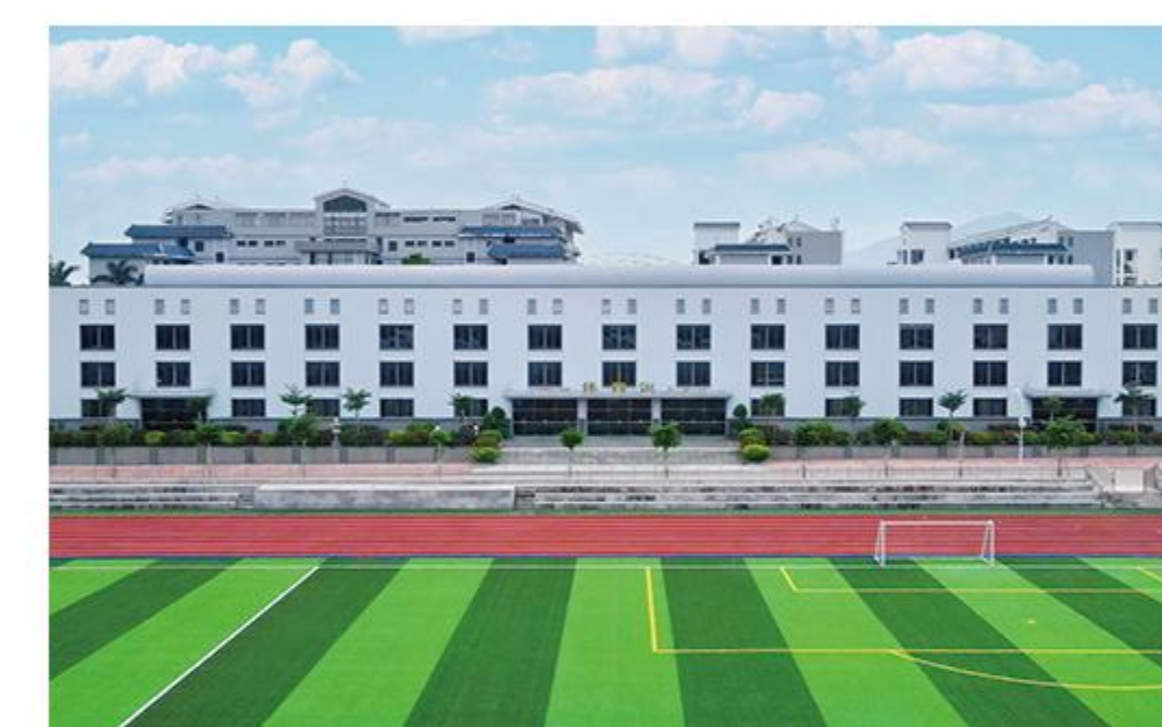
Sports Ground and Gym