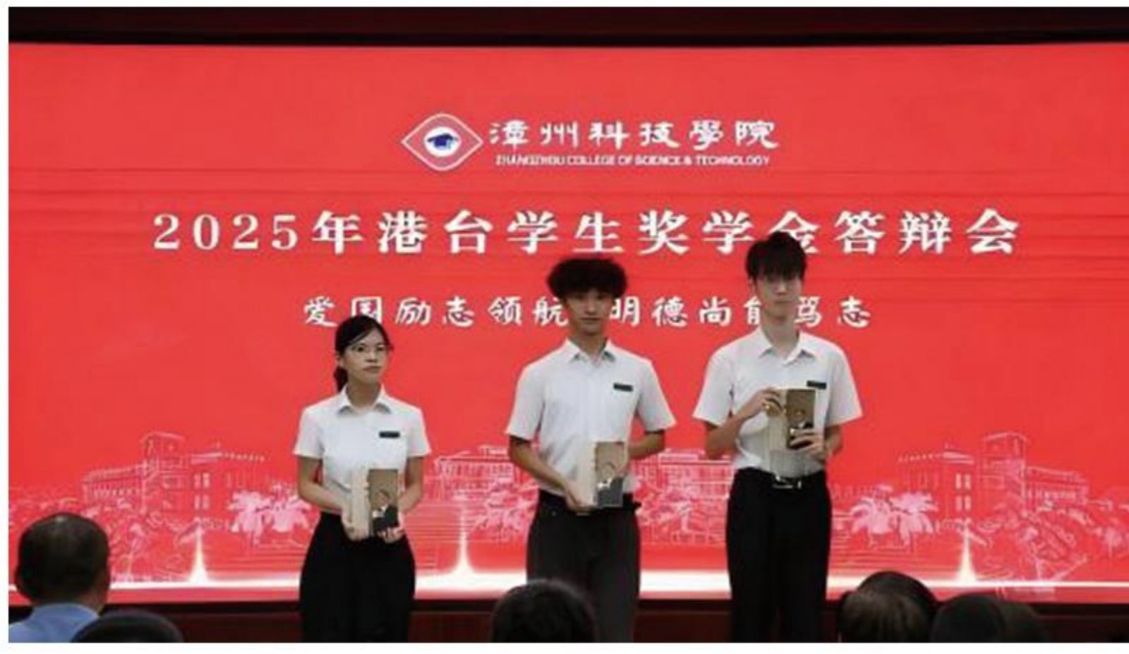
Scholarship Awards for Students from Hong Kong and Taiwan