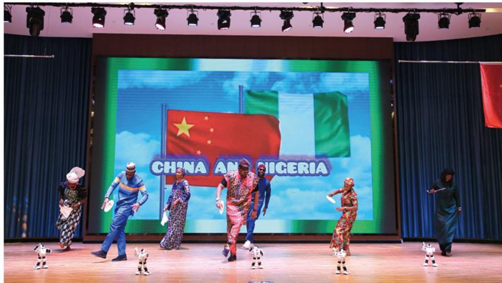
The Dance Performance of Closing Ceremony

In addition, ZCST has absorbed dozens of overseas students from Taiwan and Hongkong areas, playing a positively significant role in promoting the cross-strait relations.