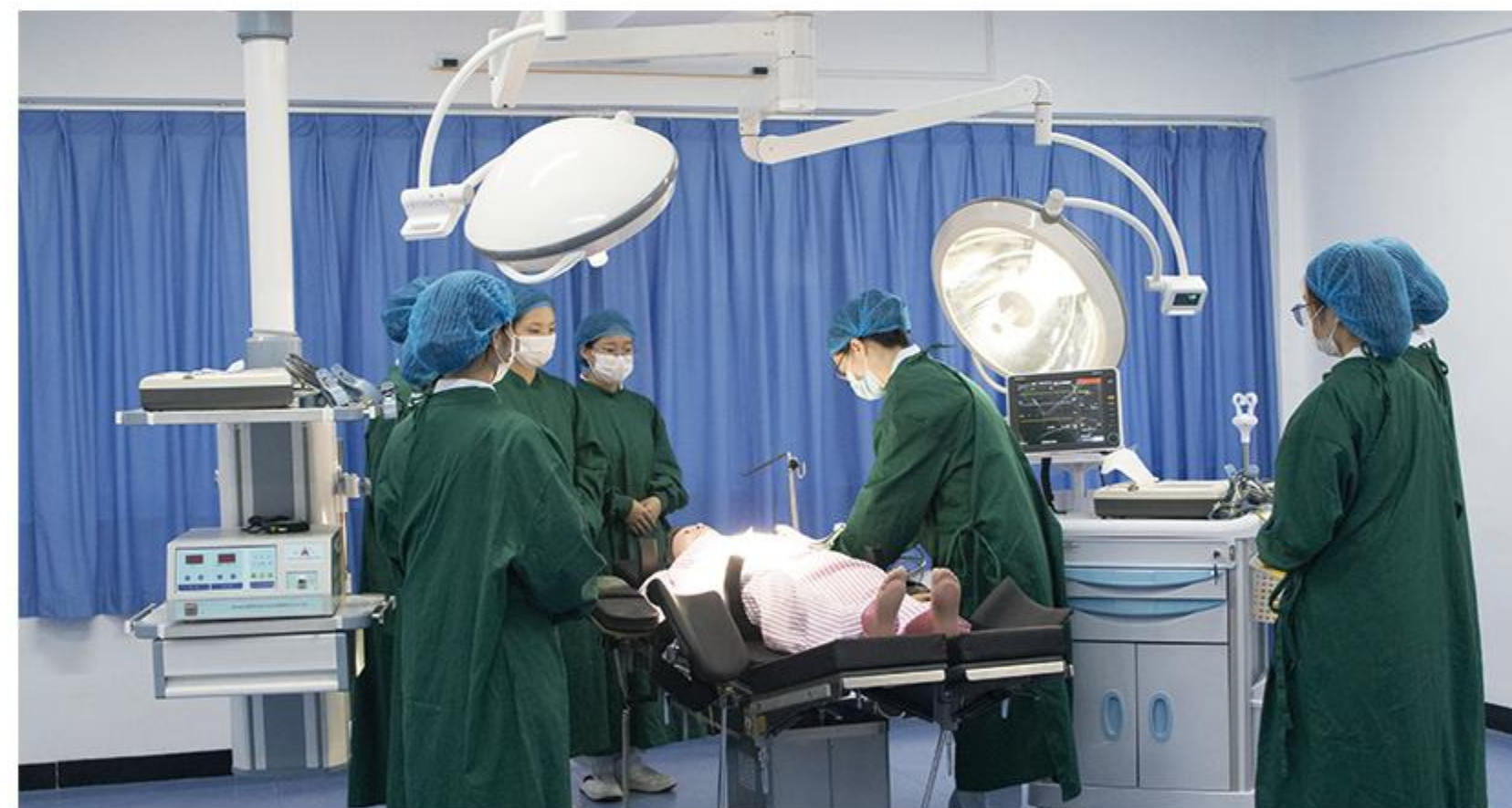
Surgical Operation Training Course

As the core speciality of ZCST, the Medical School has been committed to cultivating high-quality medical professionals since its establishment in 2020. It has formed in-depth cooperation with Tenfu Hospital, the college-affiliated hospital, and built an industrial park integrating multiple functions such as teaching, scientific research, and medical services.