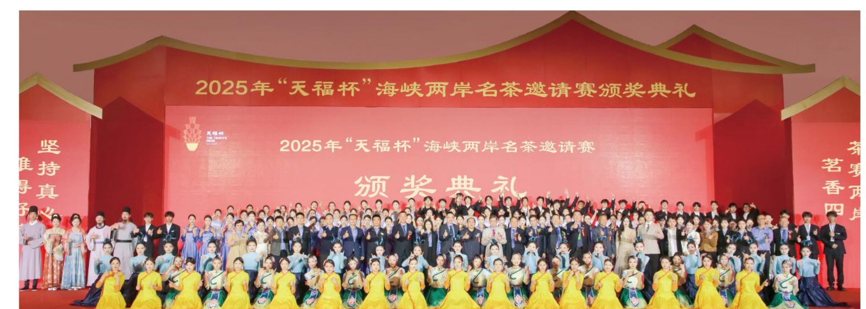
Having co-hosted "The Tenfu's Prize" Cross-Strait Competition for 15 consecutive years

In College-Enterprise Integration, ZCST has successfully launched a variety of training programs with Tenfu Group, co-built training bases with dozens of enterprises across the country. All these programs and projects have achieved precise alignment for the teaching and industrial requirements, providing students with dual guarantees for practical professional training and employment.