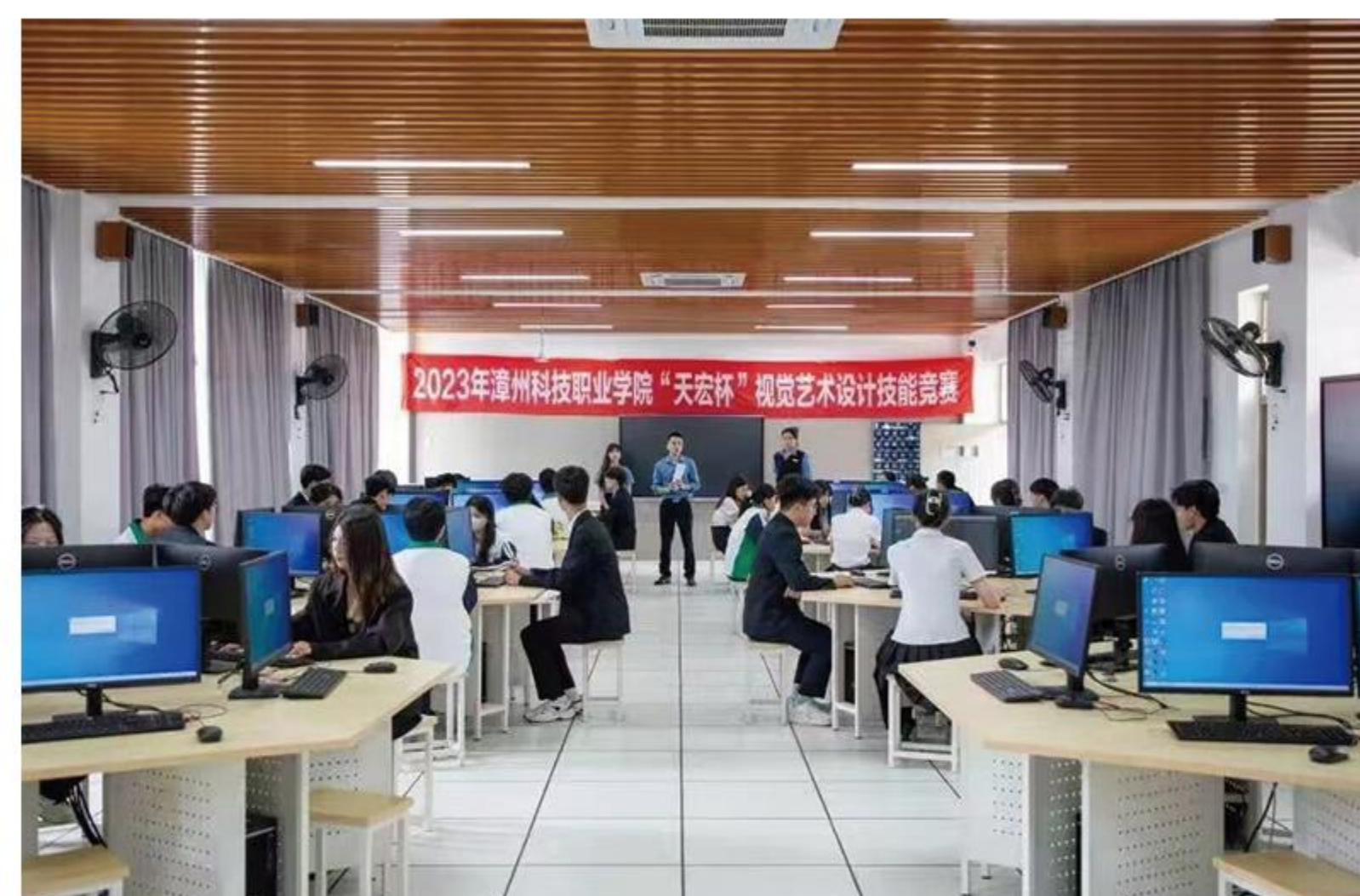
Design Competition of Art Design and Architecture School