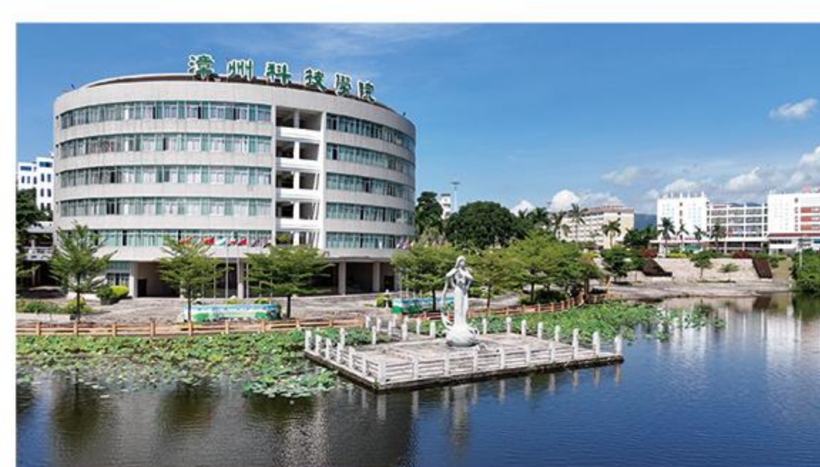
Swan Lake in Campus