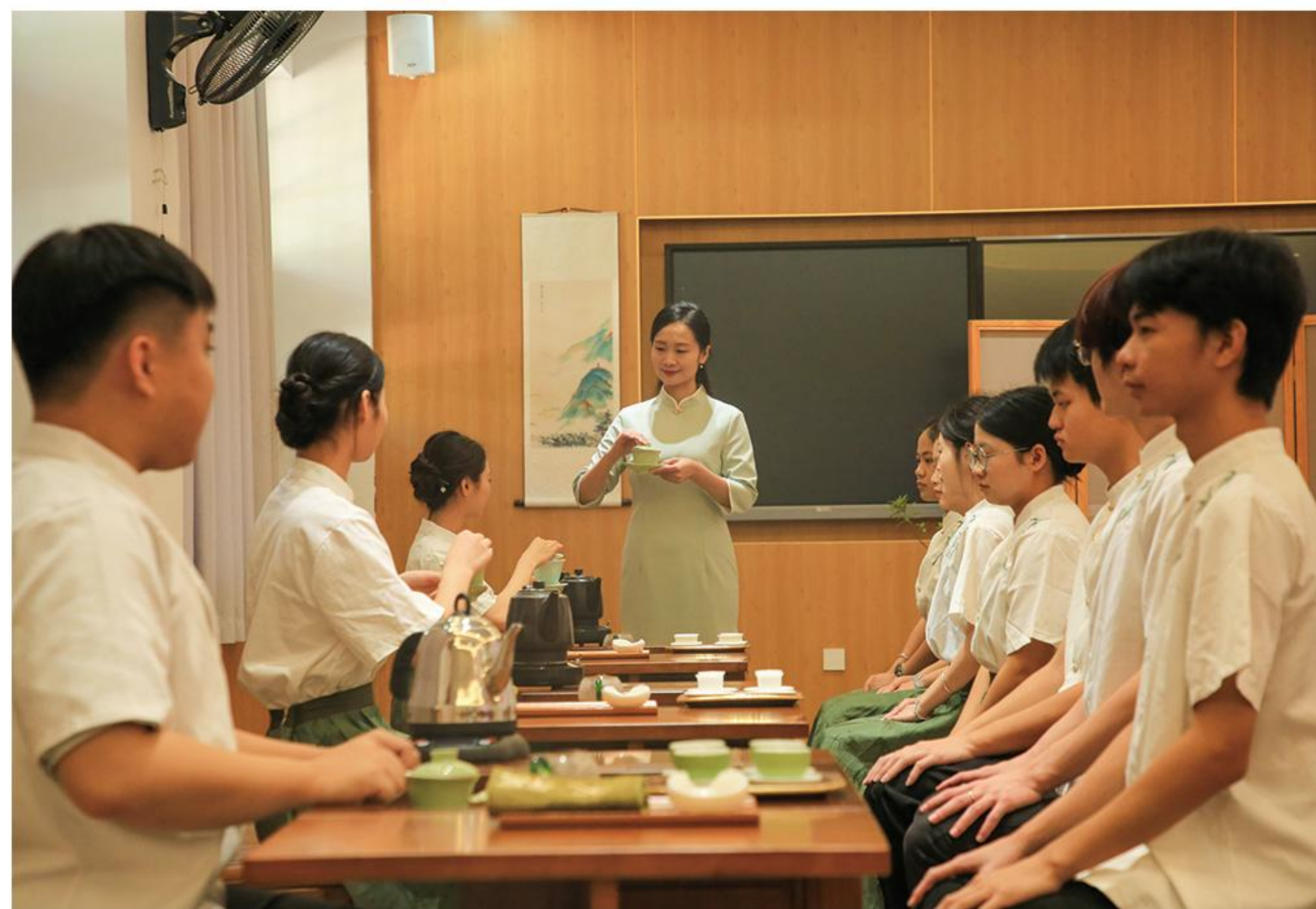
Tea Art Class

With a strong and lofty educational plot, ZCST has more than 17,000 students and 800 faculties in seven secondary schools committed to cultivating and educating high-level technical professionals for the 21st century. ZCST offers more than 42 majors among these different schools covering a variety of sci-tech and art majors, including tea and food science&technology, business, arts, tourism, education, medicine, information technology, and artificial intelligence as well.