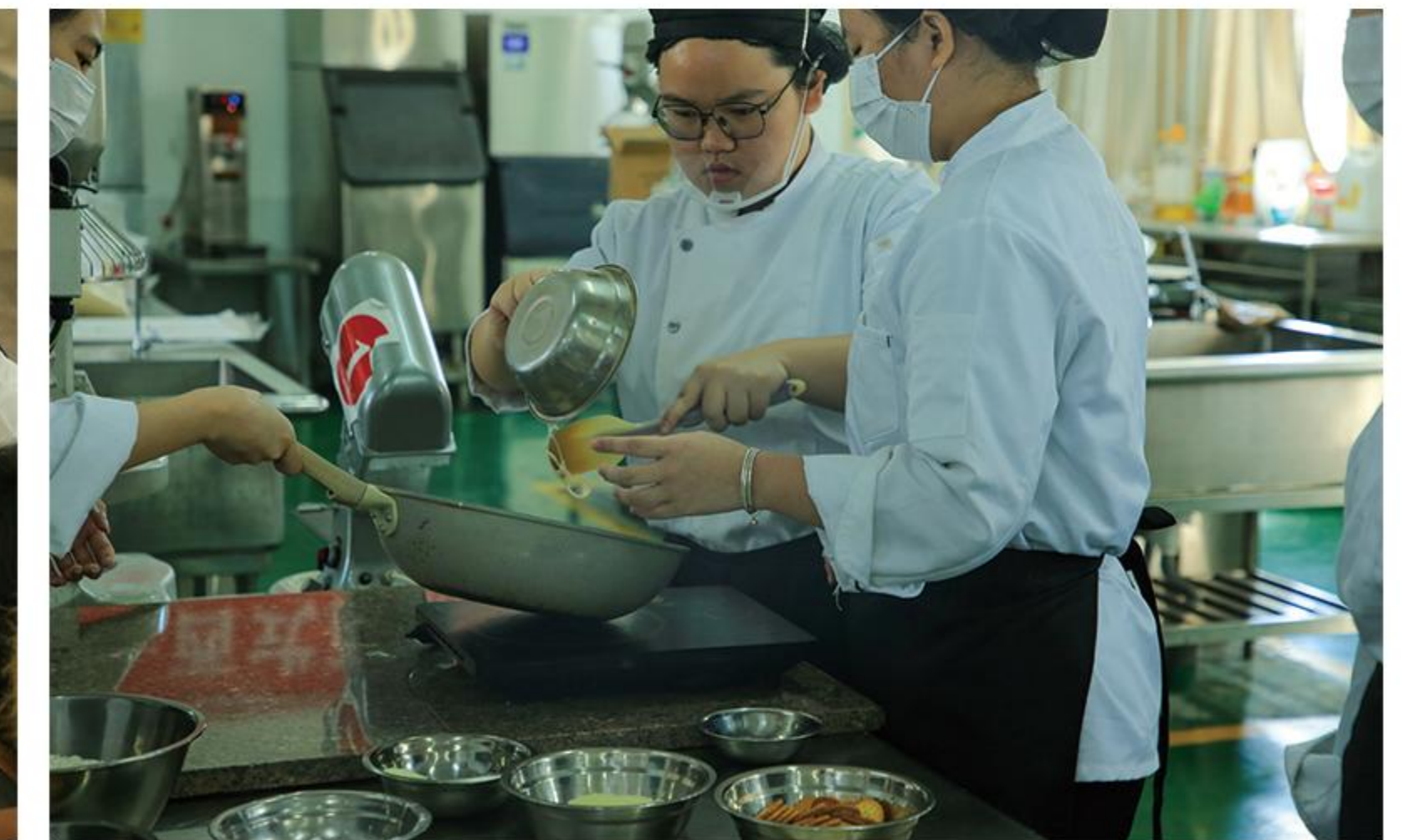
Food Making Class

The School holds a number of high-quality professional credentials, such as a provincial-level “Double High-Level” professional group and state-level key majors. Equipped with comprehensive practical training platforms and solid hardware capabilities, the school has established various high-quality platforms, including national and provincial-level practical training bases, high-skilled talent training bases, and collaborative innovation centers. Furthermore, as the Certified Tea Artist Examination Center authored by the National Ministry of Human Resources and Social Security, the school serves as a provincial-level training base for the yearly World Skills Competition and a pilot unit for the reform of provincial vocational skill level certification, providing strong support for practical teaching as well as fostering a large quantity of well-known talents in the tea industry.