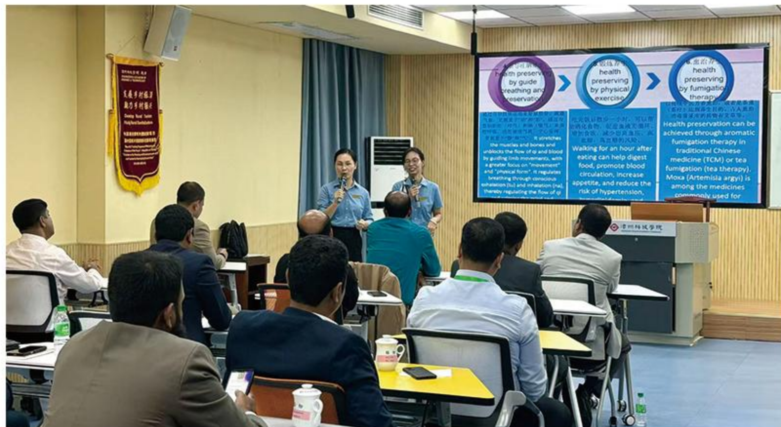
Foreign Participants in Class