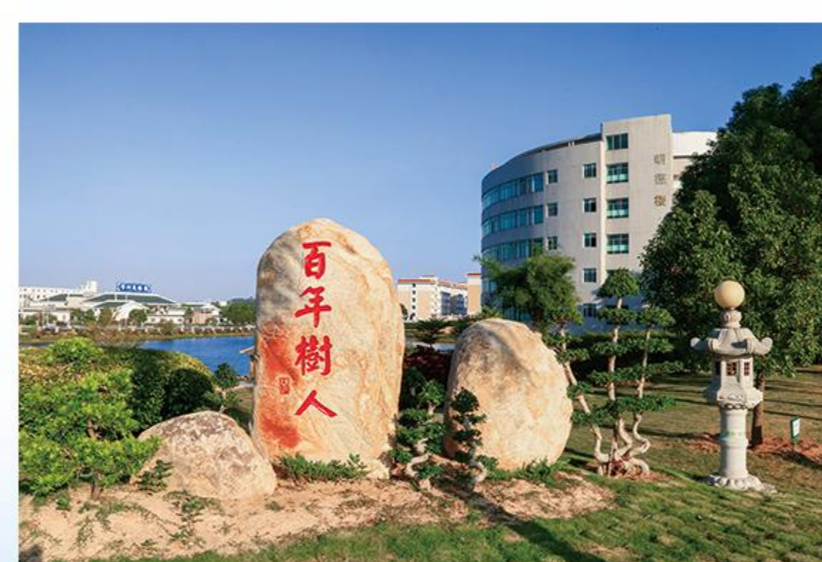
One of the Tea Gardens